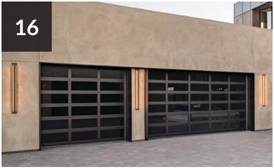
FEATURED: VertiStack® Avante® door, Dark Bronze anodized frame with black laminate glass panels Project by: Sun West Custom Homes