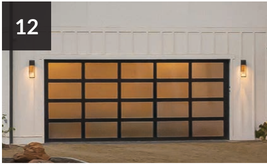
FEATURED: Avante® AX door with Black anodized frame and frosted glass panels Project by: Living Stone Design + Build