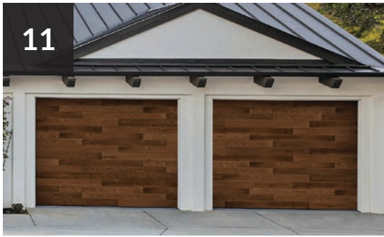
FEATURED: Modern Steel™ Ultra-Grain® Plank door in Kona finish Project by: Elyse McCurdy Home Designs Inc.