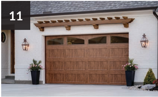
FEATURED: Bridgeport™ Steel long panel door with ARCH1 windows in Dark Ultra-Grain finish