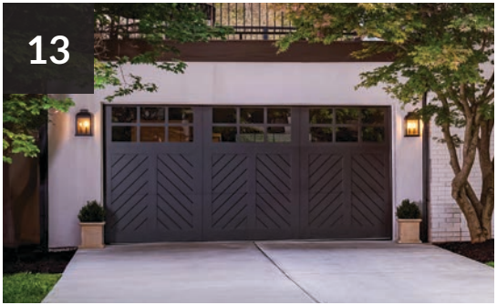
FEATURED: Reserve® Extira® wood custom door design in Black