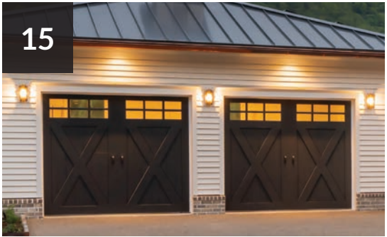
FEATURED: Canyon Ridge® 5-Layer Carriage House door, Design 21 with SQ23 windows in Black Project by: Living Stone Design + Build