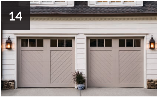
FEATURED: Canyon Ridge® Chevron door, Design 11 with REC 13 windows custom painted