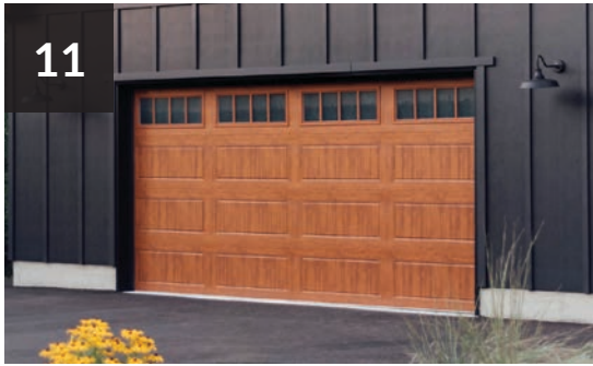
FEATURED: Gallery® Steel long panel door with REC 14 windows in Medium Ultra-Grain finish Project by: Elyse McCurdy Home Designs Inc.